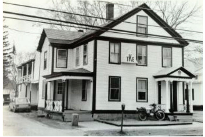
53 Marlboro Street circa 1987

In 1988 the Lambda Sigma Chapter of Tau Kappa Epsilon was forced to sell our long time residence at 53 Marlboro Street in Keene. In March of that year the city of Keene performed a building inspection of the property and cited the Chapter for a number of infractions including the condition of the roof, foundation, Sprinkler system, and many other less serious issues. As a result the City Condemned the building, forced all of us to move out and gave us 60 days to submit a plan to repair the house. The chapters finances at the time did not allow for this to happen as the estimated costs to bring the house into compliance was in excess of what the building was even worth at that time. With no income from rent coming in and no capital to improve the property the Chapter was forced to sell or be foreclosed on.